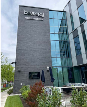
BEST EGG IN WILMINGTON, DE LOCATED AT THE CONCORD PLAZA

The Buccini/Pollin Group, Inc. (BPG) recently completed the second phase of a multimillion-dollar renovation project designed to transform the former Concord Plaza in Wilmington, Delaware into an upscale multi-use environment filled with corporate offices, luxury apartments and high-end retail space. This included the grand opening of a three-story, 60,000 sq. ft. Class A office building that is now the new home of financial technology company, Best Egg.