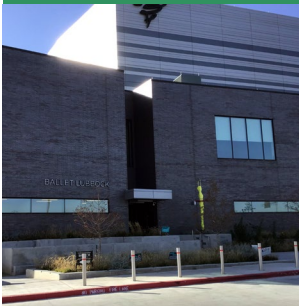
BUDDY HOLLY HALL OF PERFORMING ARTS