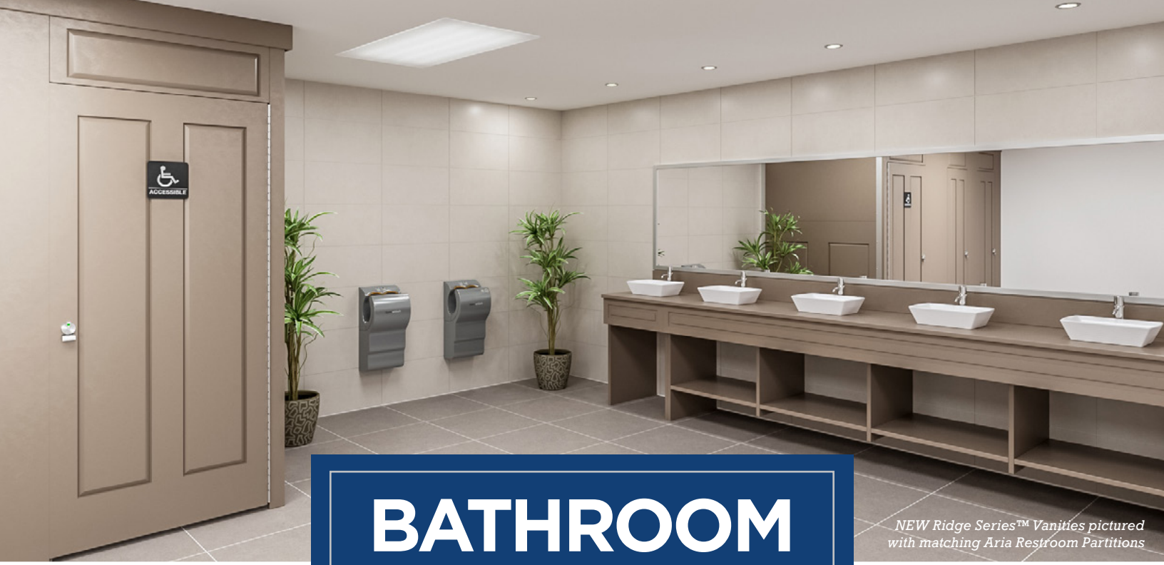
NEW Ridge Series™ Vanities pictured with matching Aria Restroom Partitions