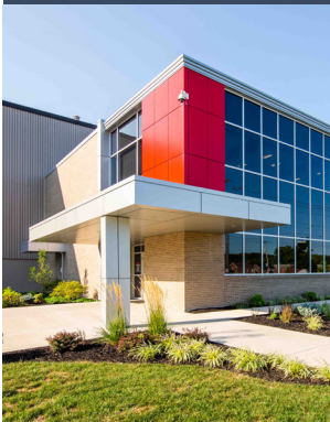
KINSLEY CONSTRUCTION'S NEW CORPORATE OFFICE IN YORK, PENNSYLVANIA

Kinsley's corporate management team wanted the master builder integrity reflected throughout the new facility from entryways to