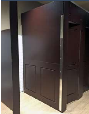
THE SACRAMENTO REGIONAL BUILDERS EXCHANGE ARIA PARTITIONS™

Opened in late 2017, SRBX's new offices boasts a distinctive color scheme of rich blues, burgundies, and wood tones mixed with polished concrete floors, glass walls, and murals