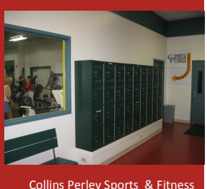
Collins Perley Sports & Fitness Center Tufftec Hunter Green Lockers

The center gets about 600,000 user visits to its facility each year, about 400,000 of which are unrelated to school functions. "That's a lot of swinging and banging on toilet stall doors and slamming of locker room doors, said Kimel, "so wear and tear is important." He said most of the old metal lockers still worked but they looked old and got absolutely no respect from the school kids. "We had constant problems with scratching and graffiti," said Kimel. "Since we put new Tufftec® lockers in we haven't had a single incident of damage."