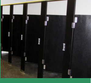
KFC YUM! Center Hiny Hiders Bathroom Partitions

There are few rowdier environments than a sports arena, but that hasn't stopped Scranton Products' Hiny Hiders® bathroom partitions from standing up to whatever joys or frustrations the KFC Yum Center's Louisville, KY, fans might vent. The sparkling new $258 million, 722,000 sq. ft. arena seats 22,5000 fans, replacing the Freedom Hall near the Kentucky Fairgrounds built in the 1960s. Located on the Ohio River, the KFC Yum! Center is home to the University of Louisville men's and women's basketball teams as well as ice shows, circus performances and concerts.